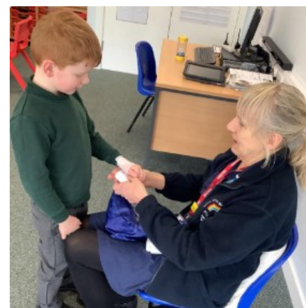
Finding out how the nurse can help us.