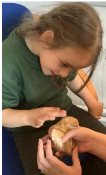
Having some time looking at the newly hatched chicks.