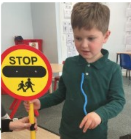
Role-playing different jobs.