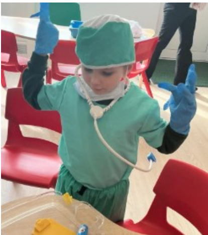
Role-playing different jobs.