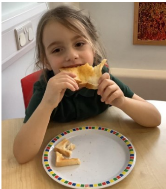
Independence skills - making our own toast.

Here are some photos from some of the fun learning we enjoyed before the holiday.