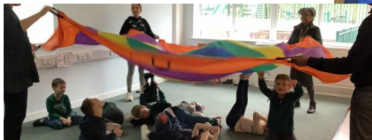
Communication Music - Parachute fun!