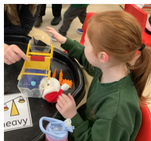
Exploring weight with the scales in Maths.