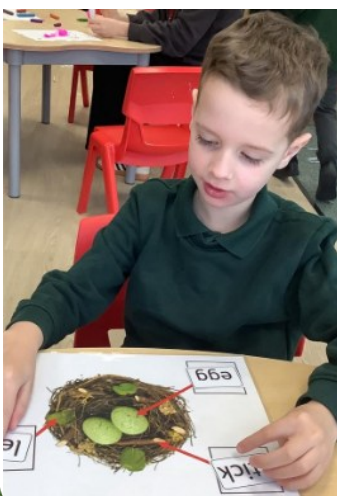
Working hard in English!