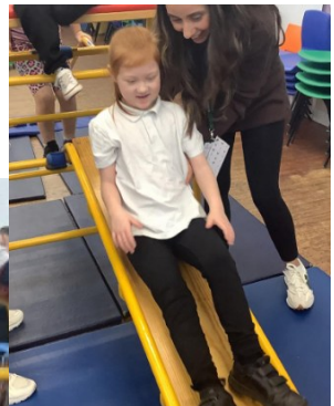
Exploring some fun activities during Endeavour to be active week.